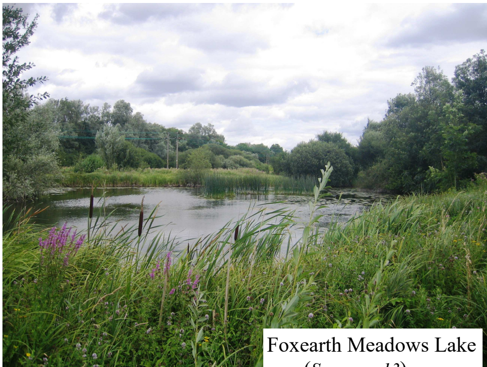
Foxearth Meadows Lake (See page 13)

Inwardly we are being renewed day by day.