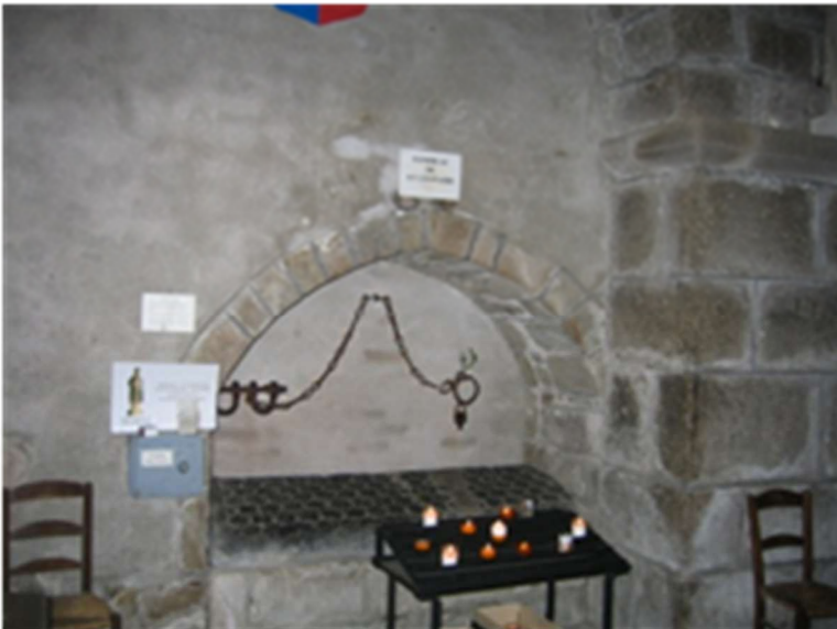
The tomb of St Leonard in France