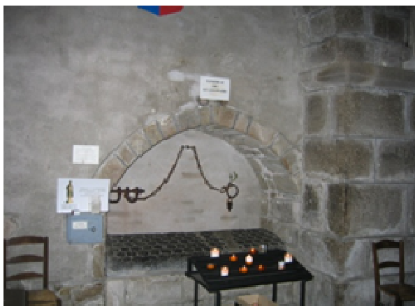
St Leonard's Tomb 2004

We know a little of Leonard, much legend. He was a Frank, born in the late 5 th century. Legend says he was a courtier to King Clovis, the first Frankish king in France. They were both converted to Christ in 496 by St Remy. Leonard became a hermit in the forest East of Limoges, where he gathered several disciples. His prayers were seen as causing miraculous healings of women in labour and the release of prisoners. Leonard is the patron saint of both groups. He died in 559AD and is celebrated on 6 November.